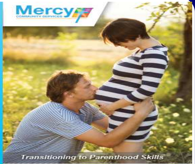
Transitioning to Parenthood Skills