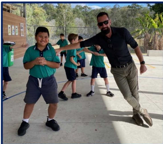
A great friend to lean on in Rock and water!